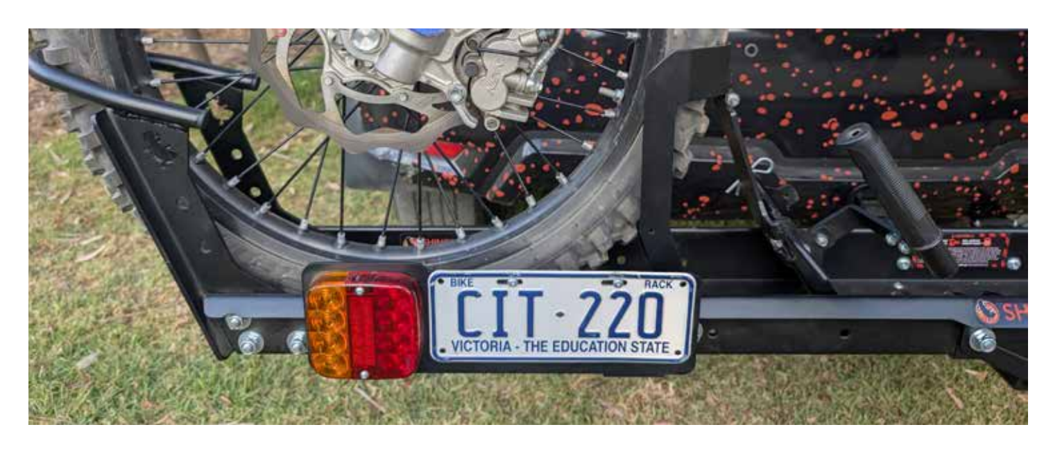
STEP 8. REAR WHEEL TRAY

Fit the Rear Wheel Tray (RWT) as shown, fasten with 4 small bolts.