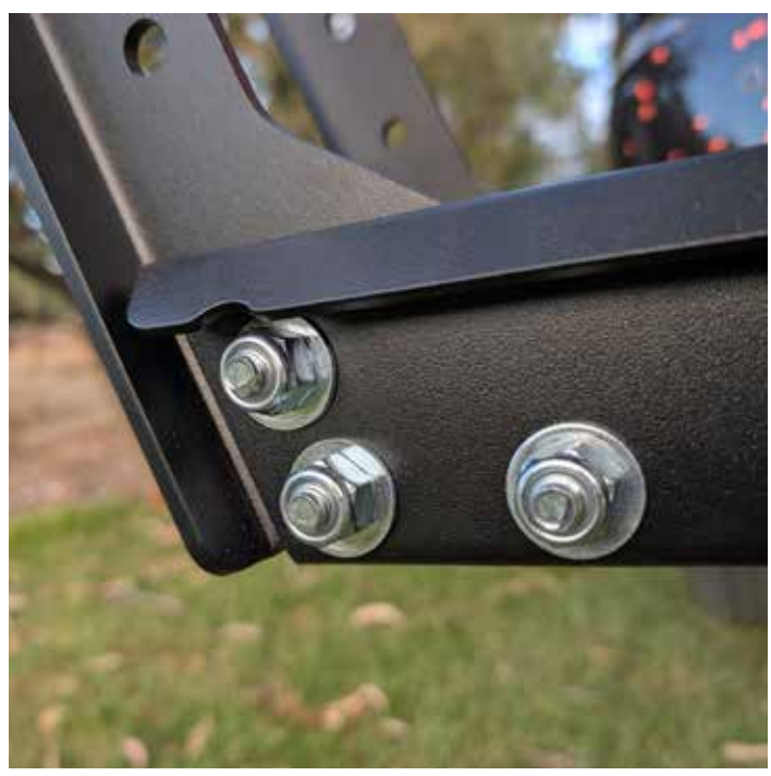
STEP 6. LOCK CHOCK

Is fitted from factory in the standard position to suit dirtbikes with a 21" front wheel. Fit the handle and bracket as shown, and note that it can be configured in a few different ways to suit different bikes.