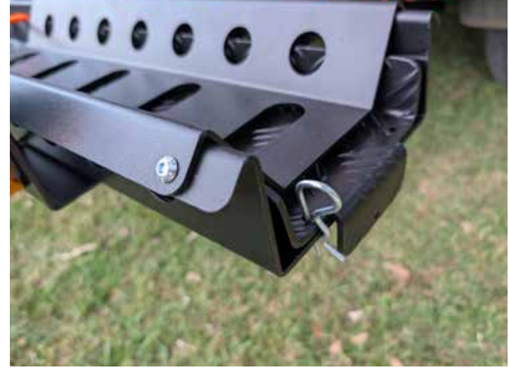
STEP 9. INSERT THE RAMP

Secure with the R clip and the bungee to eliminate annoying rattle.