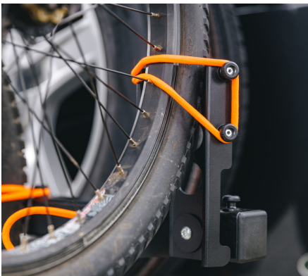
Extender in raised position

Depending on the size of the bikes tyre, the bungee loop can be attached to either or both black buttons to ensure tension on the bungee.