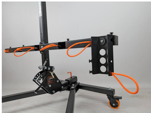
Extender in lowered position

Place one washer under the head of the bolt and one at the rear with the nut, tighten firmly but don't crush the bottom bar.